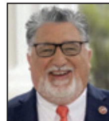
State Senator Anthony Portantino